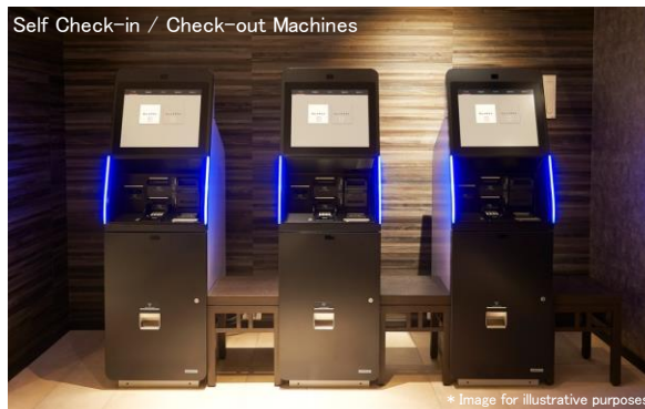
Self Check-in / Check-out Machines