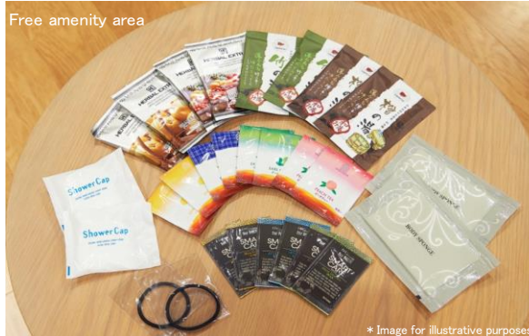
Free amenity area