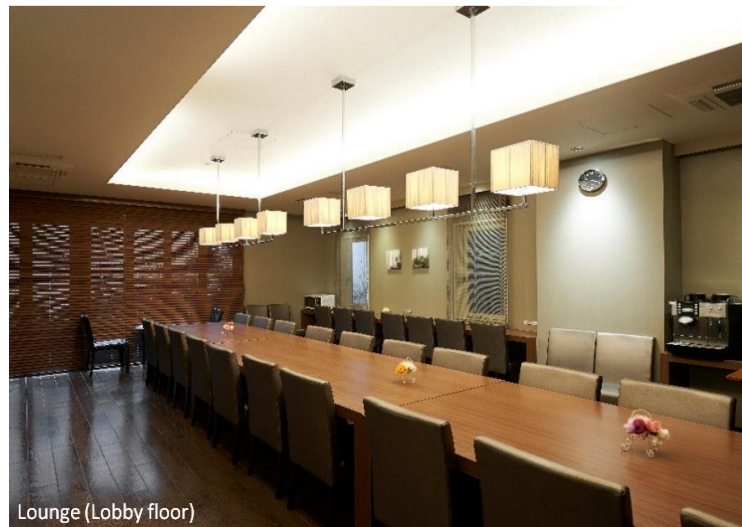
Lounge (Lobby floor)