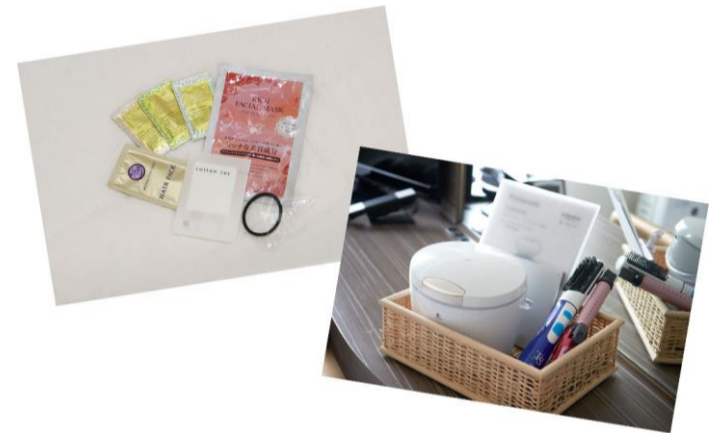
Women's amenity kit