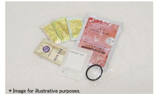
* Image for illustrative purposes.

* Other complimentary amenities are available for your choice in the lobby.