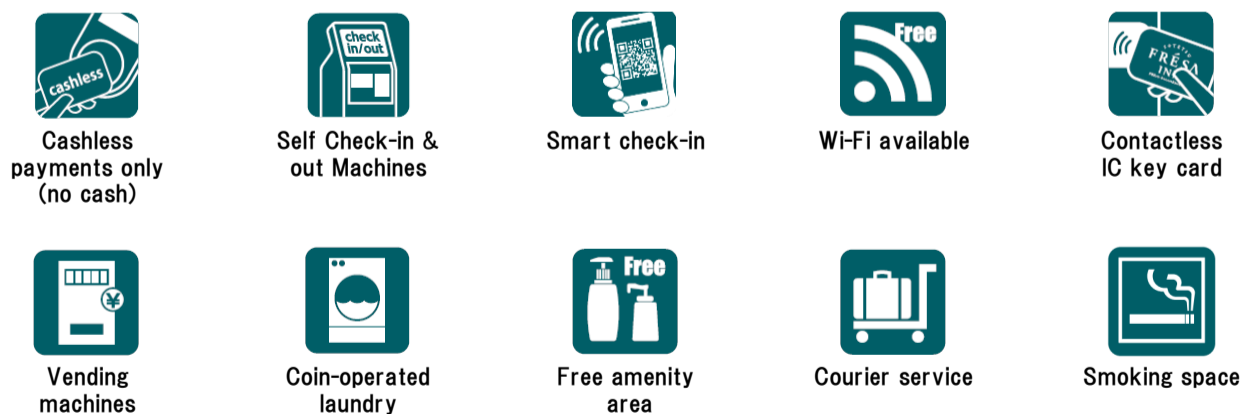
Free amenity area